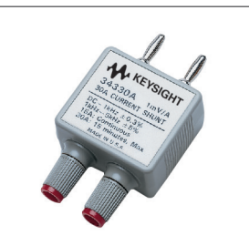
34330A current shunt (30 A)