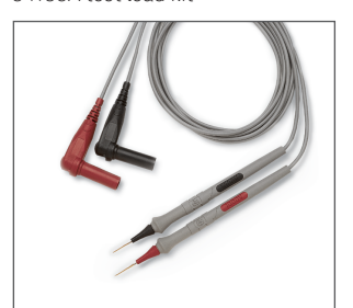
34133A precision electronic test leads