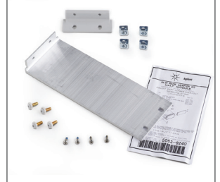
U3400A -1CM rack mount kit